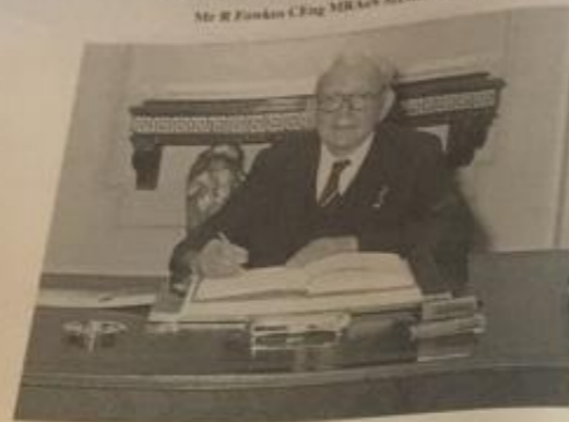
Sir Frank signs the visitors book in the Founders Gallery, College Hall Officers Mess

There is no doubt that I was both very fortunate and privileged to have been so closely associated with Sir Frank Whittle. A wonderful friend and a man who became the greatest engineer of this century, he was a modest genius and had many attributes other than just sheer technical brilliance. He had, in addition, courage, determination, dignity and generosity, together with an infectious sense of humour.