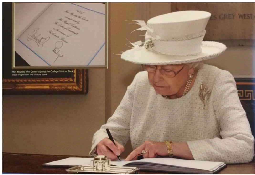
HM Queen Elizabeth II 28 May 2009