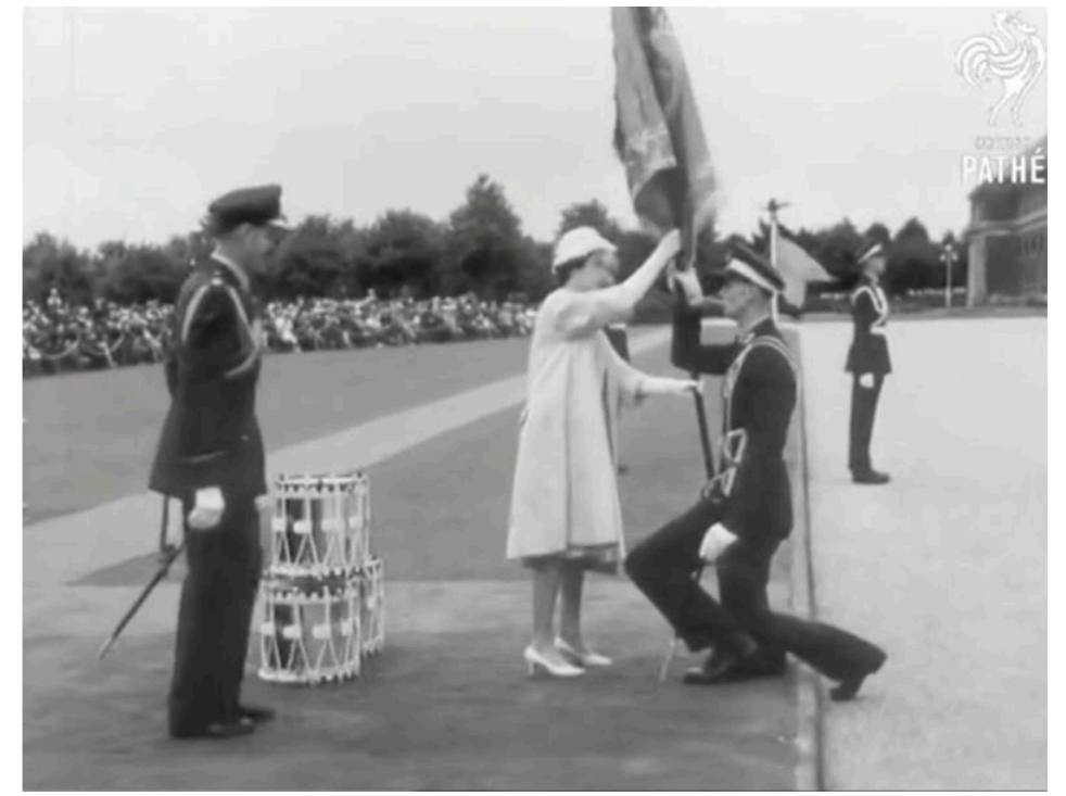
HM Queen Elizabeth II 25 July 1960