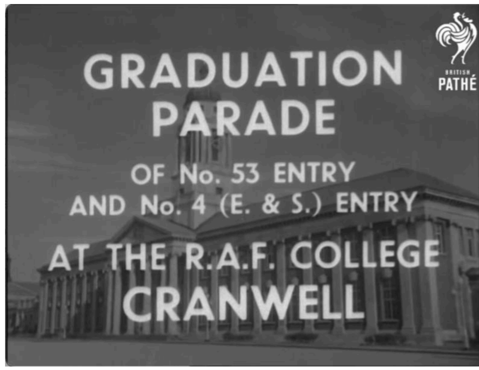
HRH Princess Elizabeth 1 August 1951

Cntrl/Cmd+Click on the Graphic for each visit