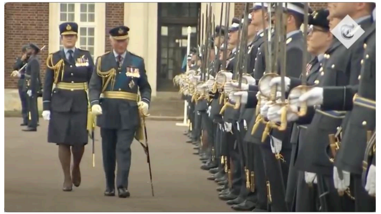
HRH Prince Charles College100 2019