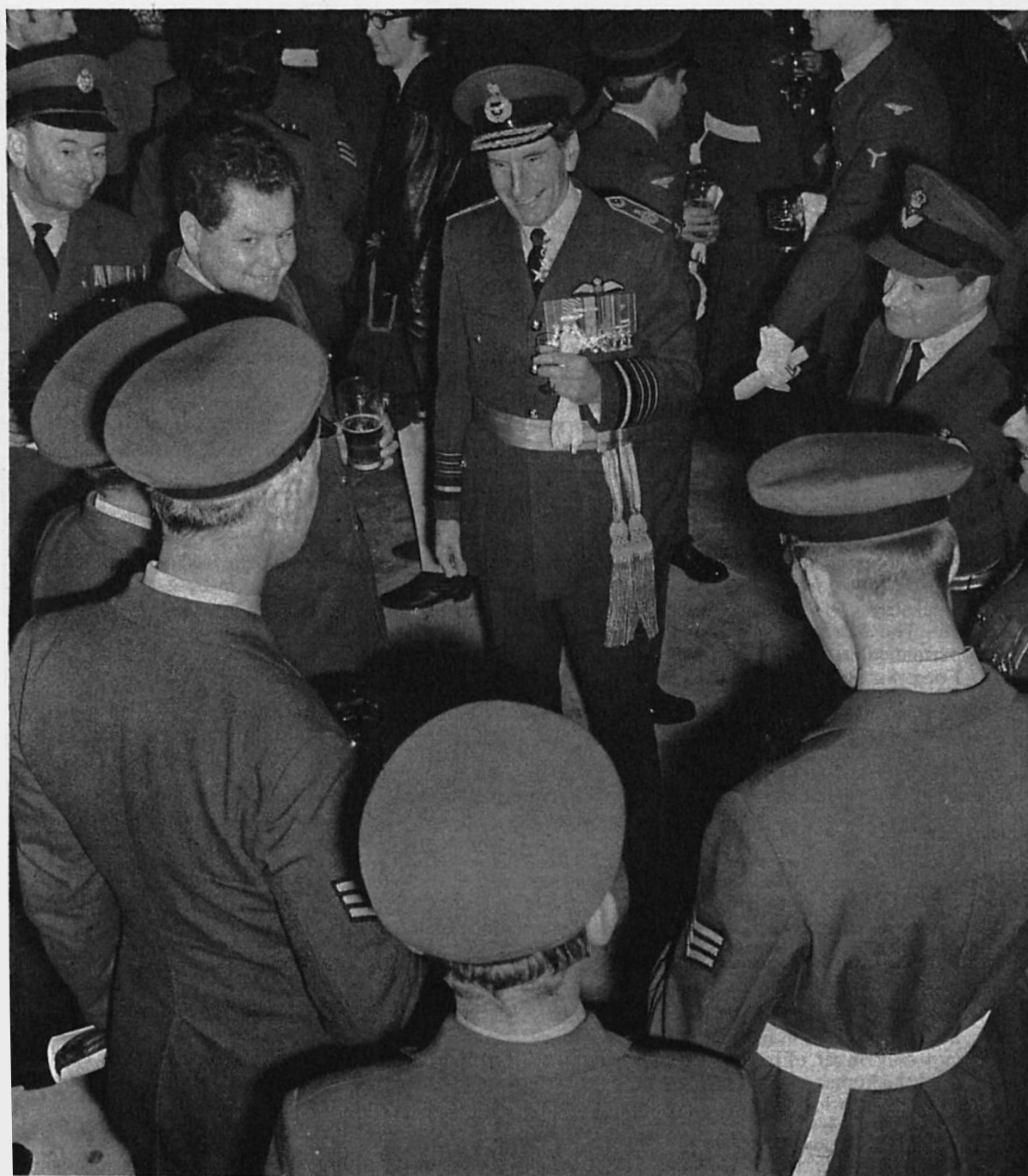
Marshal of the Royal Air Force Sir Andrew Humphrey GCB OBE DFC AFC