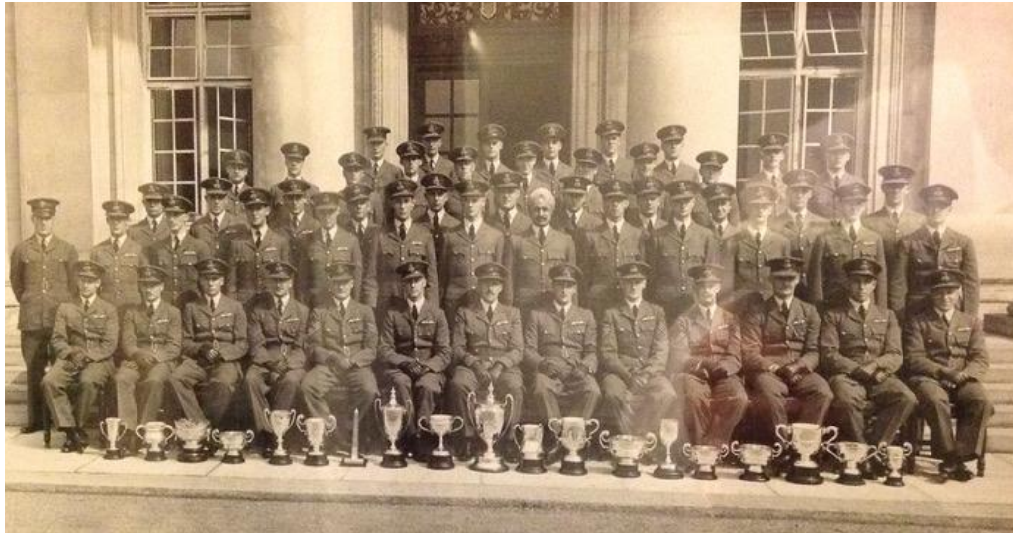
"B" SQUADRON, ROYAL AIR FORCE COLLEGE, CRANWELL JULY, 1939