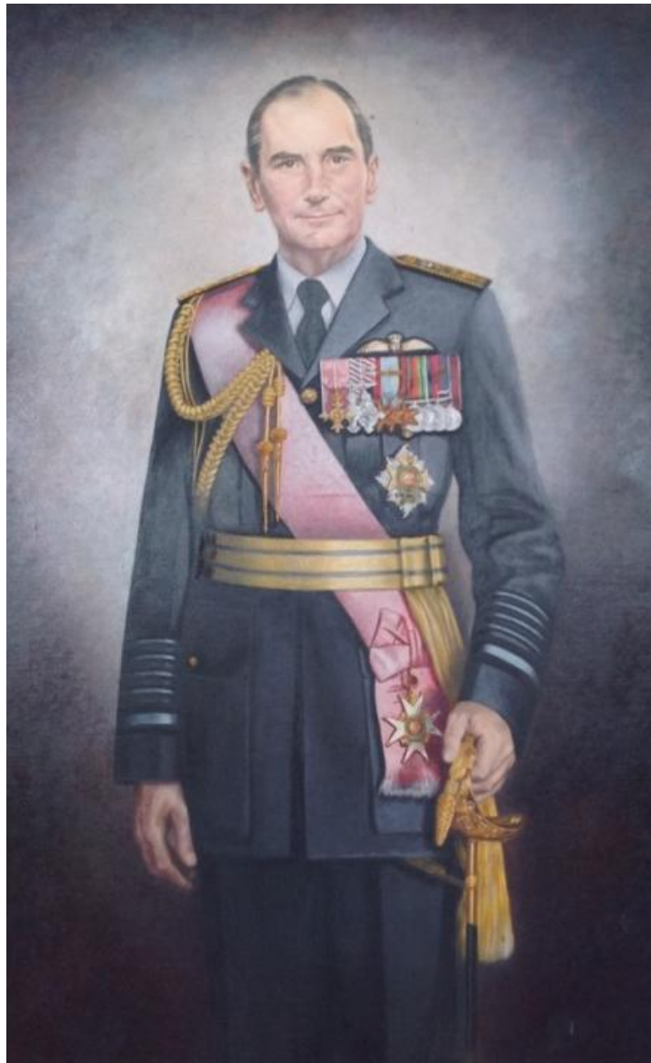
Marshal of the Royal Air Force Sir Andrew Henry Humphrey GCB, OBE, DFC, AFC & Two Bars (10 Jan 1921 – 24 Jan 1977)

Marshal of the Royal Air Force Sir Andrew Henry Humphrey fought in the Second World War as a fighter pilot, taking part in the Battle of Britain, and also took part in the withdrawal from Aden in November 1967.