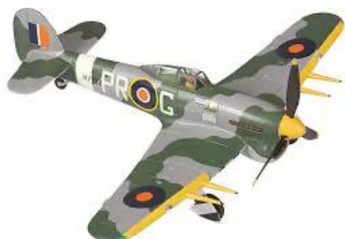
Typhoon Mk Ib of 609 Squadron