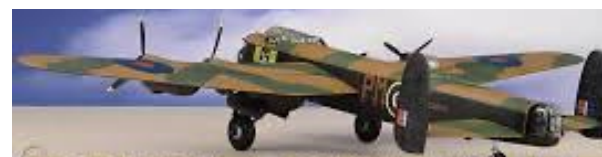
Lancaster III 103 Sqn