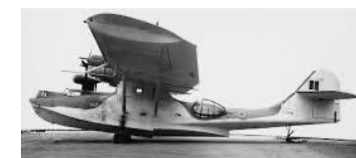
Catalina I of 205 Sqn

In October 1941, the Western DAF had 16 squadrons of aircraft (nine fighter, six medium bomber and one tactical reconnaissance) and fielded approximately 1,000 combat aircraft by late 1941. By the time of the Second Battle of El Alamein, the DAF fielded 29 squadrons (including nine South African and three USAAF units) flying Boston, Baltimore and Mitchell medium bombers; Hurricane, Kittyhawk, Tomahawk, Warhawk and Spitfire fighters and fighter-bombers. There were over 1,500 combat aircraft, more than double the number of aircraft the Axis could field.