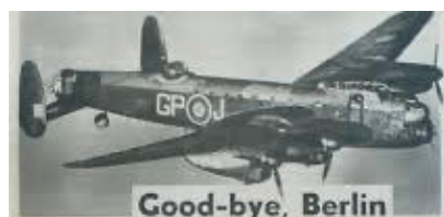
Lancaster I 101 Sqn