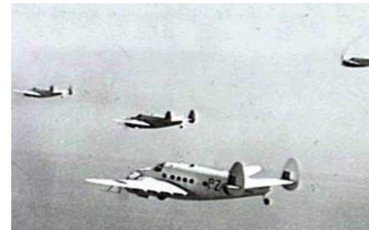
Hudson V 53 Sqn