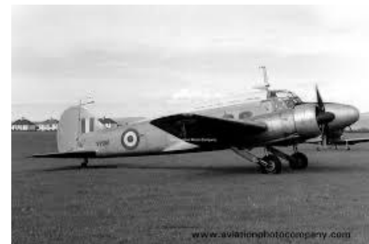
Avro Anson I of Coastal Command

The primary task of Coastal Command was to protect convoys from the German Kriegsmarine's U-boat force. It also protected Allied shipping from the aerial threat posed by the Luftwaffe .