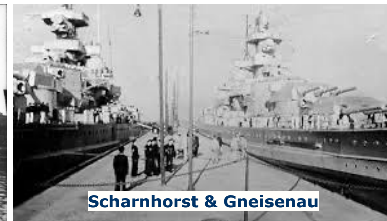
Scharnhorst & Gneisenau