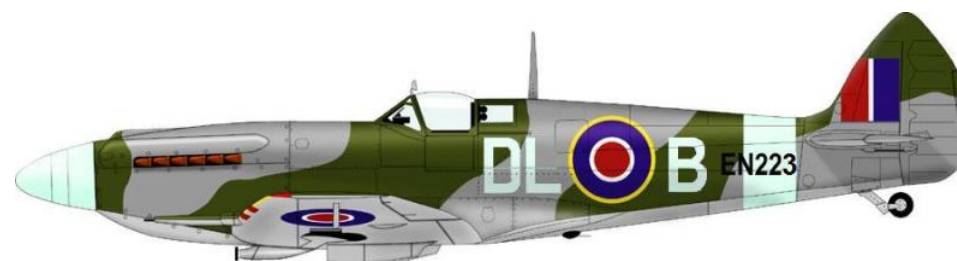
Spitfire XII EN223 of 91 Squadron