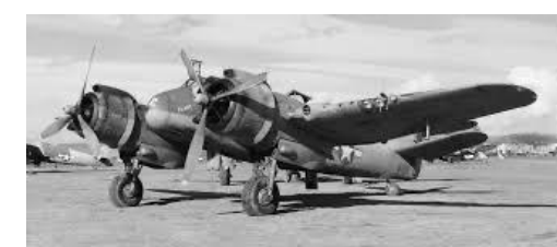
Beaufighter VI f

The DAF, also known chronologically as Air Headquarters Western Desert, Air Headquarters Libya, the Western Desert Air Force, and the First Tactical Air Force (1TAF), was an Allied tactical air force created from No. 204 Group RAF under RAF Middle East Command in North Africa in 1941, to provide close air support to the British Eighth Army against Axis forces. Throughout World War II, the DAF was made up of squadrons from the RAF, the South African Air Force (SAAF), the Royal Australian Air Force (RAAF), the United States Army Air Forces (USAAF) and other Allied air forces.