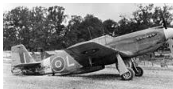
USAAF Mustang of 268 Squadron