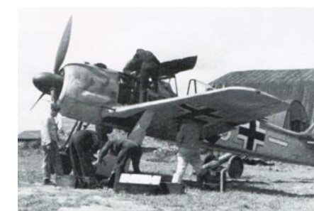
Fw190 of JG26 at Abbeville