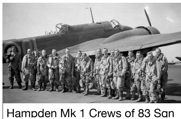
Hampden Mk 1 Crews of 83 San