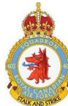
Weaver C III