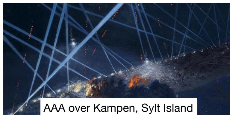
AAA over Kampen, Sylt Island