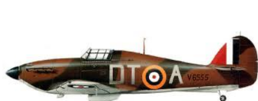
Hurricane I 257 Sqn Flown by Cranwellian Coke DA The Hon