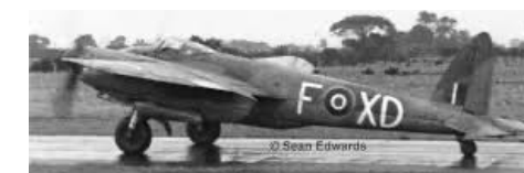
Mosquito XVI 139 Sqn

The Battle of Berlin raged from 1942 until March 1944, when Bomber Harris conceded that his area bombing strategy, the only strategy left open to him at the time, just was not working. Where the strategy had succeeded in the Battle of the Ruhr and against Hamburg, Berlin posed too great a challenge not least because of the limited range of our own fighter support, the imprecision of the much longer range night operations to Berlin and the German air defences protecting their capital.