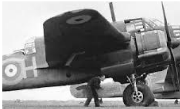
Beaufort I 22 Sqn