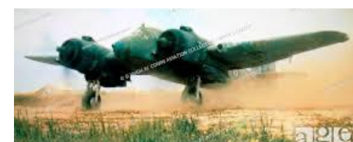
Beaufighter Ic of 252 Sqn