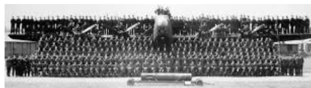
Lancaster II 432 Sqn