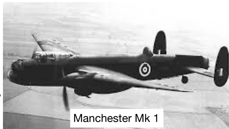
Manchester Mk 1