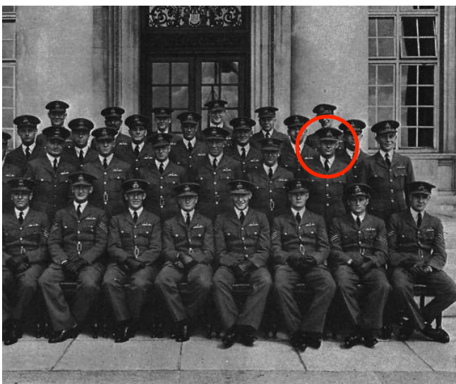
VI TERM, SUMMER, 1938.