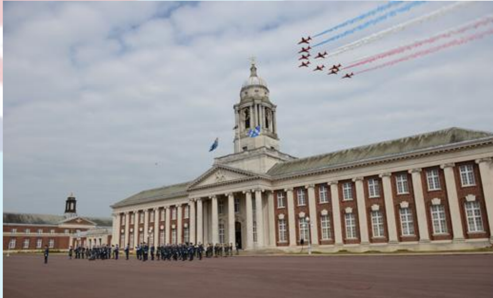
The Old Hangar Church of St Michael's and All Angels