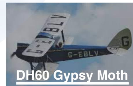
DH60 Gypsy Moth