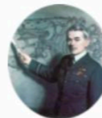
Click to View Tribute