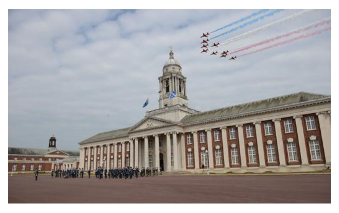
S24 Entry Graduated July 1926