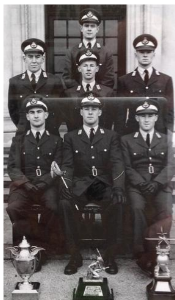
PRIZEWINNERS — DECEMBER, 1957