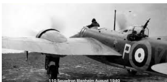
Blenheim IV 110 Sqn