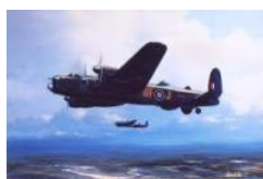
Lancaster 97 Sqn