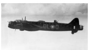
Manchester I L7427