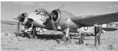
Blenheim I 211 Sqn

The DAF, also known chronologically as Air Headquarters Western Desert, Air Headquarters Libya, the Western Desert Air Force, and the First Tactical Air Force (1TAF), was an Allied tactical air force created from No. 204 Group RAF under RAF Middle East Command in North Africa in 1941, to provide close air support to the British Eighth Army against Axis forces. Throughout World War II, the DAF was made up of squadrons from the RAF, the South African Air Force (SAAF), the Royal Australian Air Force (RAAF), the United States Army Air Forces (USAAF) and other Allied air forces.