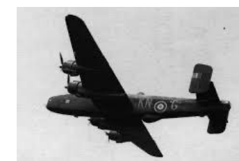
Halifax II 77 Sqn