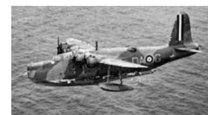
Catalina I 210 Sqn

Coastal Command also served in an offensive capacity. By 1943 Coastal Command finally received the recognition it needed and its operations proved decisive in the victory over the U-boats.