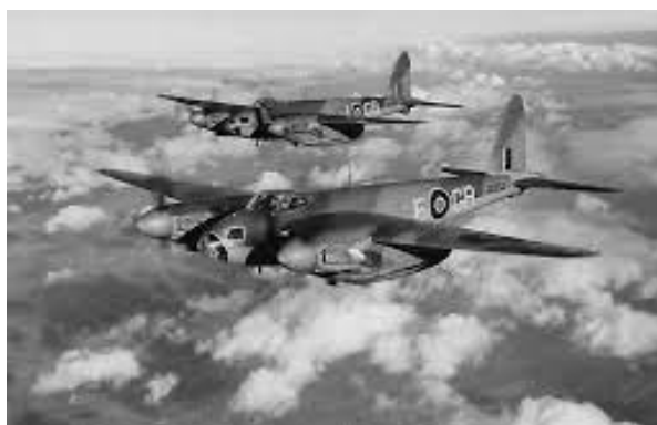
Mosquito B Mk IV

AviationSafetyNetwork an exclusive service of Flight Safety Foundation