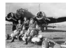
Hampden 83 Sqn