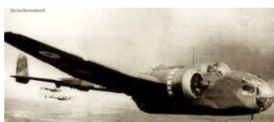
Hampden Mk 1