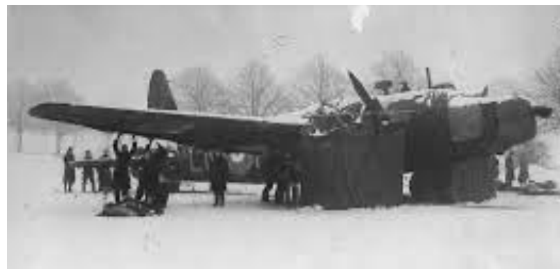
Wellington Ia 99 Sqn Newmarket 1941