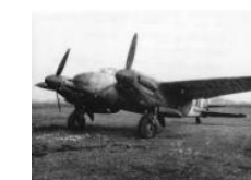
Mosquito 515 Sqn