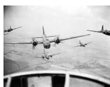
Wellingtons of 9 Sqn