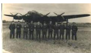
Lancaster III 49 Sqn