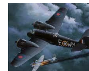
Beaufighter 1F 219 Sqn