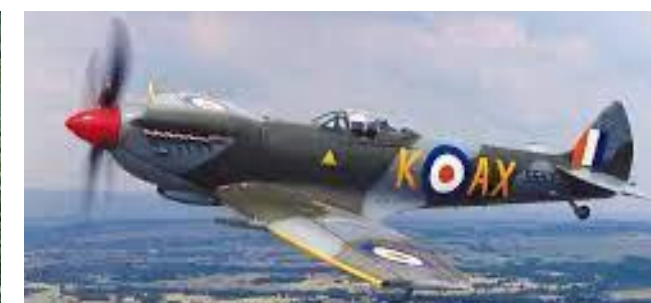
Spitfire XVI RR249