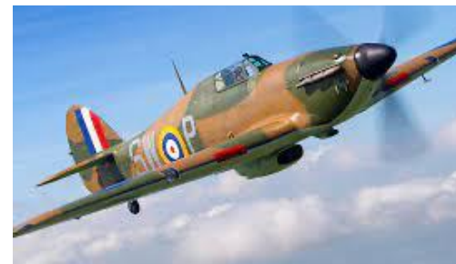
Hurricane Mk I