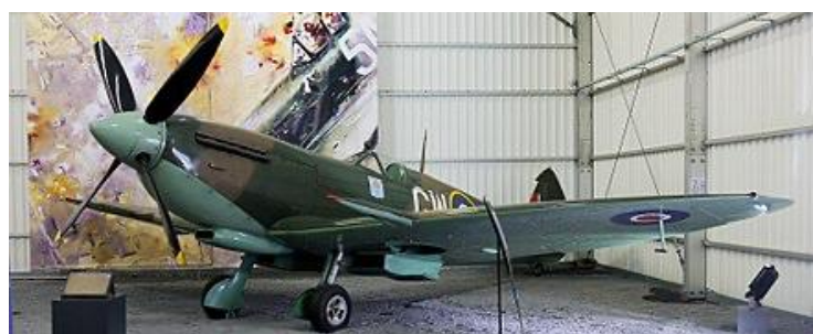
Spitfire XVI Free French 340 Sqn