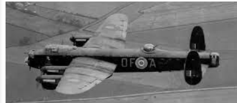
Lancaster I 97 Sqn