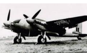
Mosquito VI NS875