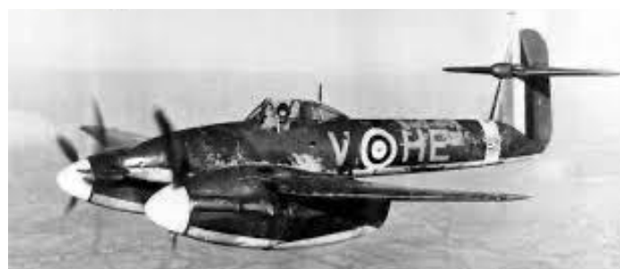
Whirlwind 263 Sqn