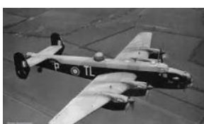
Halifax II Of 35 Sqn