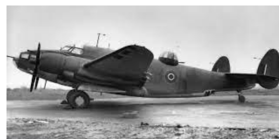
Ventura II 464 Sqn