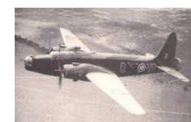
Wellington II W5375