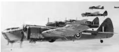
Blenheim IVs 11 Sqn