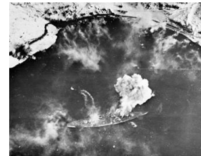
Tirpitz attacked April 1942