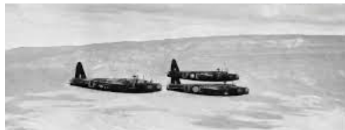
Wellingtons Ic 37 Sqn

In October 1941, the Western DAF had 16 squadrons of aircraft (nine fighter, six medium bomber and one tactical reconnaissance) and fielded approximately 1,000 combat aircraft by late 1941. By the time of the Second Battle of El Alamein, the DAF fielded 29 squadrons (including nine South African and three USAAF units) flying Boston, Baltimore and Mitchell medium bombers; Hurricane, Kittyhawk, Tomahawk, Warhawk and Spitfire fighters and fighter-bombers. There were over 1,500 combat aircraft, more than double the number of aircraft the Axis could field.