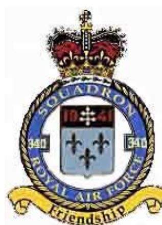
Carre JJM Lt