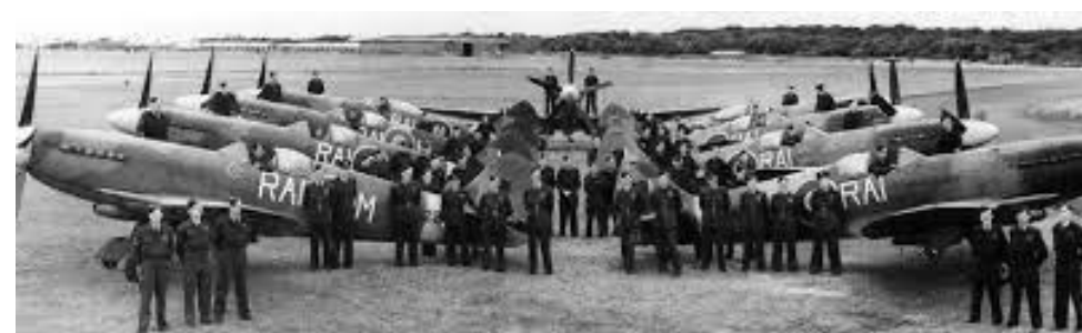
Spitfires V 602 Sqn