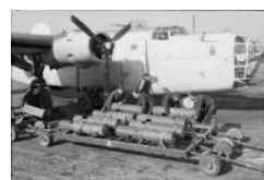
Liberator 53 Sqn