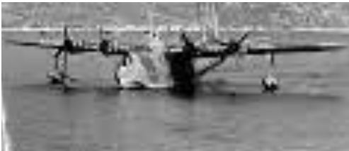
Sunderland I T9048

Prior to the establishment of the Desert Air Force (DAF), several RAF formations operated in North Africa. On 3 September 1939, RAF Middle East Command—under Air Chief Marshal Sir William Mitchell, Air Officer Commanding-in-Chief Middle East - comprised four separate groups: Egypt (designated Middle East), RAF Iraq, Mediterranean at Malta, and RAF Aden (8, 203, and 94 Squadrons). Mitchell handed over to Air Vice Marshal Sir Arthur Longmore (RAF College Commandant 1929-1933) in early May 1940. When Italy declared war in June 1940, Longmore had just 29 squadrons numbering less than 300 aircraft in the four groups detailed above.