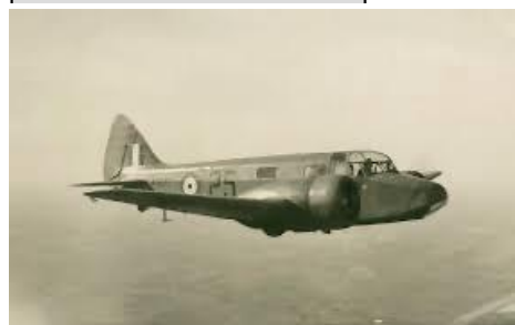
Oxford Mk II